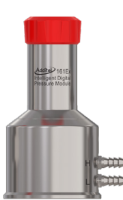
ADT161Ex pressure modules - See ADT161 Datasheet for more info