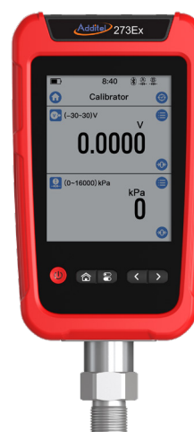
Additel 273Ex with ADT158Ex module