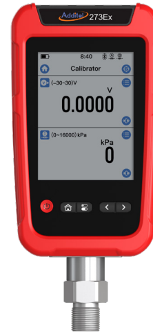
Additel 273Ex with ADT158Ex module