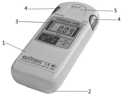
Figure 1 - Main view of the dosimeter