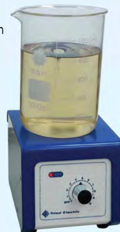
F-23 130x145mm Stirrer up to 8Liter

Powerful drive magnet • Strong motor-stirs up to 8 Liter water • Compact design maximizes use of available bench space • Variable speed control up to 1200rpm • Electronic speed control with "OFF" position • Available as 4-position stirrer, & 6-position stirrer • Powerful motor & strong magnet provide exceptional stirring even with a solution that has a viscosity similar to cooking oil • Durable, easy-to-clean, corrosion-resistant top plate available.