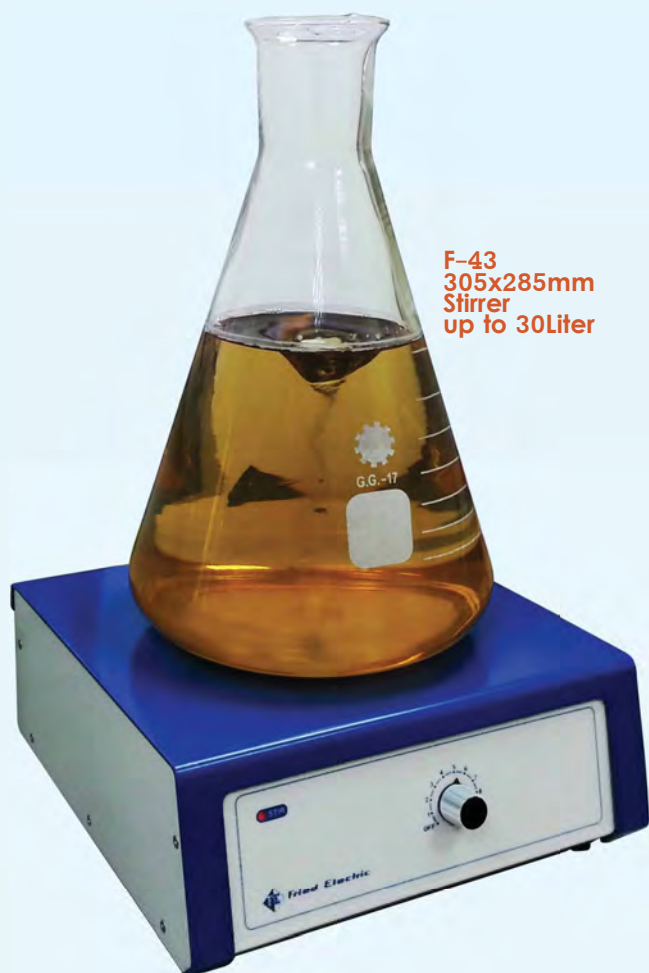
F-43 305x285mm Stirrer up to 30Liter

★ ★ ★ German AC Motor Robust & Maintenance Free Design ★ ★ ★