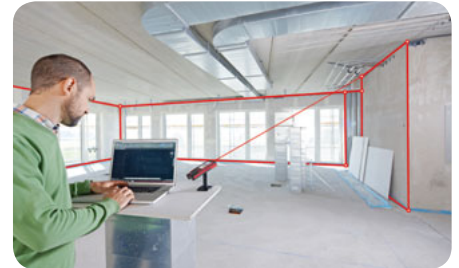
Real-time transfer of point coordinates