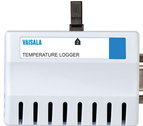
Data logger model VL-1000-21x