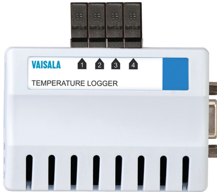
Data logger model VL-1400-44x