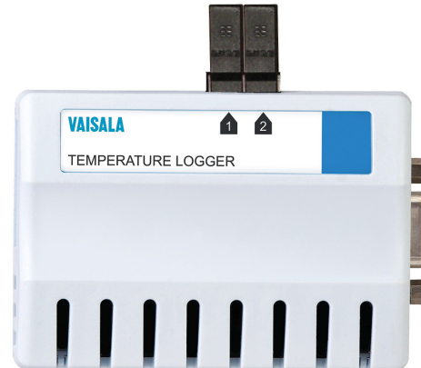
Data logger model VL-1000-22x